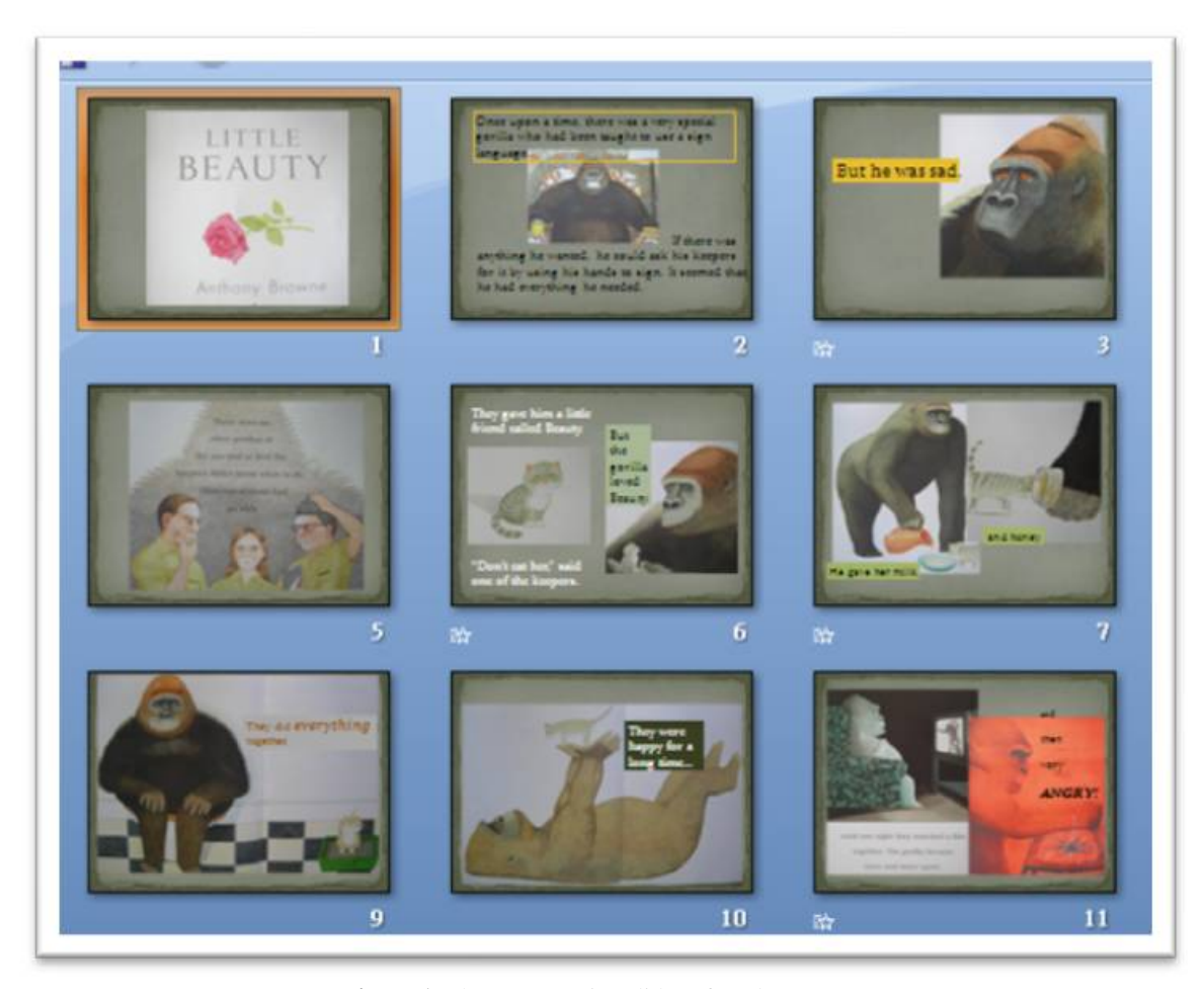
Figure 1. The Power Point Slides of Little Beauty

Using PPT designs to present stories may not be new. The use of the VoiceThread system has also been popular in education at all levels and for many different subjects, including teaching foreign languages (see http://voicethread.com/about/library/ for comments from teachers who have been utilizing the system). No studies have been done, however, to examine the application and usefulness of these technologies for teaching a foreign language to children with learning difficulties. The second aspect of this study thus investigated if using technology helps children comprehend the stories better, improve their learning motivation, and enhance their English learning in the regular English class.